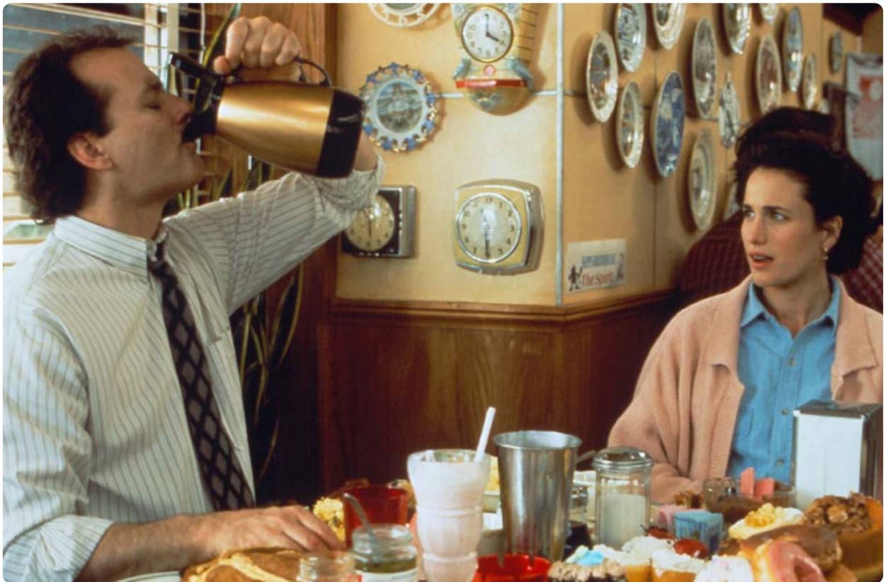
● Groundhog Day

Cynical, egocentric Pittsburgh weatherman, Phil Connors, after making a 'no blizzard' prediction for the region, reluctantly journeys to Punxsutawney with his new producer, Rita, and cameraman, Larry in order to cover the annual Groundhog Day festivities (a ritual has developed around the idea that if the groundhog sees its shadow on February 2 nd , there will supposedly be six more weeks of winter). They spend the night in Punxsutawney, cover the festival and head home, but are forced back by the blizzard Phil failed to anticipate.