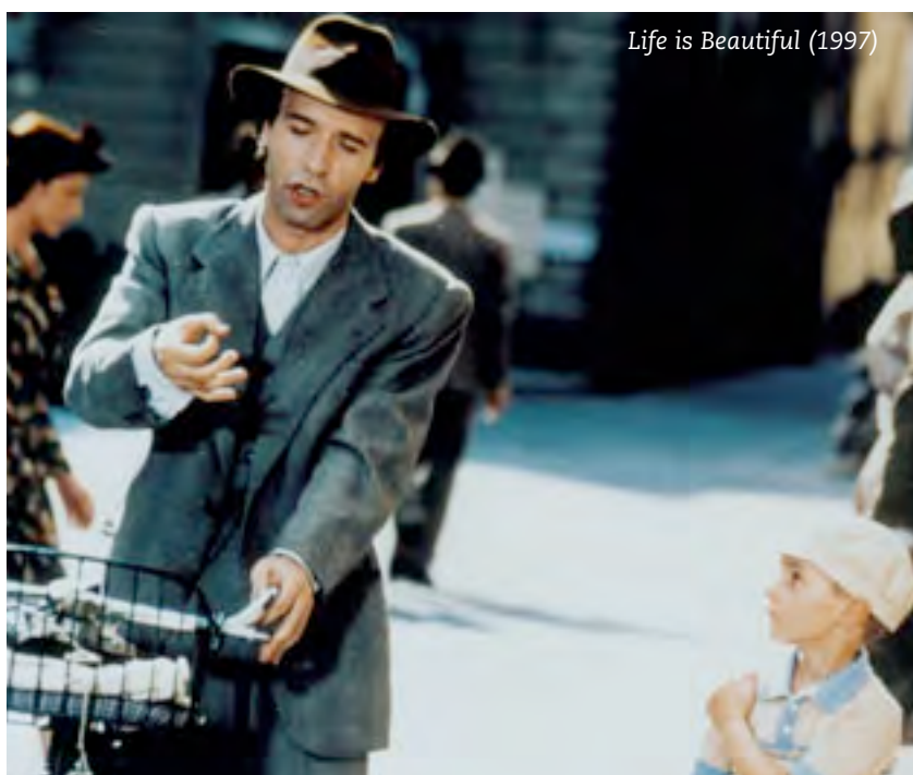
Life is Beautiful (1997)