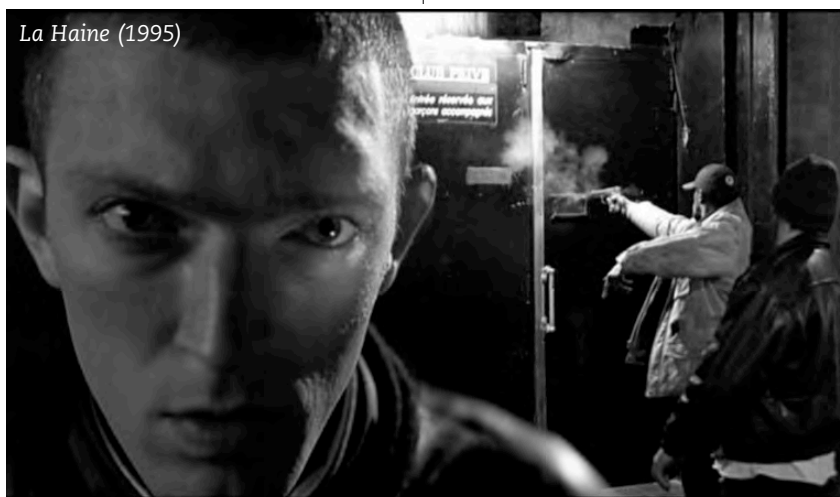
La Haine (1995)

Key study on French cinema of the 1990s. The introductory chapter provides a summary of the key events and themes of this decade and an overview of the issues raised by the familiar contributors. Part I examines the 'heritage' genre which continued to dominate. It examines sub-genres of 'official' (based on a literary text especially those featuring the likes of Gerard Depardieu in GERMINAL), 'pastiche' (REVOLUTION), 'postcolonial' (INDOCHINE) and 'Vichy' (UN HÉROS TRÈS DISCRET). These developments mirrored contemporary political developments almost as much as the return of the political film and the greater involvement of French filmmakers in political issues. Part II 'Inscribing Differences' looks at representation of gender, sexuality and ethnicity in a wide range of films such as LES NUITS FAUVES, GAZON MAUDIT and ROMUALD ET JULIETTE. The emergence of the 'cinema de banlieu' is also discussed and not surprisingly a chapter is dedicated to LA HAINE. Part III 'Defining the "National"' includes essays on masculinity in LES AMANTS DU PONT-NEUF, paterinity in MON PERE CE HEROS, the