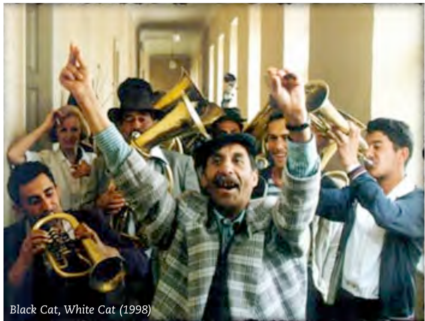
Black Cat, White Cat (1998)