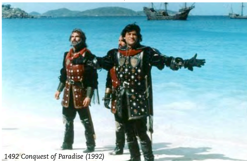
1492 Conquest of Paradise (1992)

On the co-production agreement between France and Great Britain,