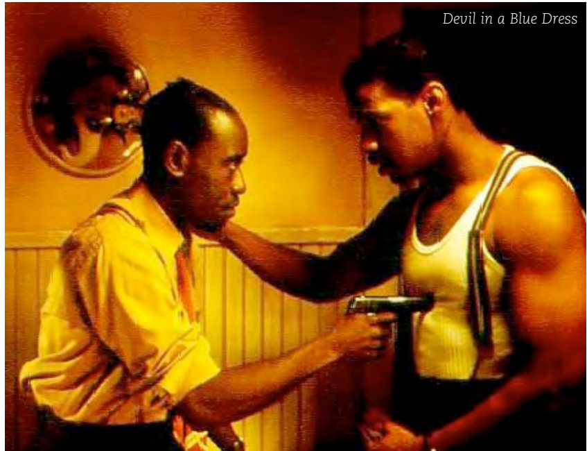
Devil in a Blue Dress

Comparing a scene at the end of the film with classic film noir scenes featuring the hurt hero, the