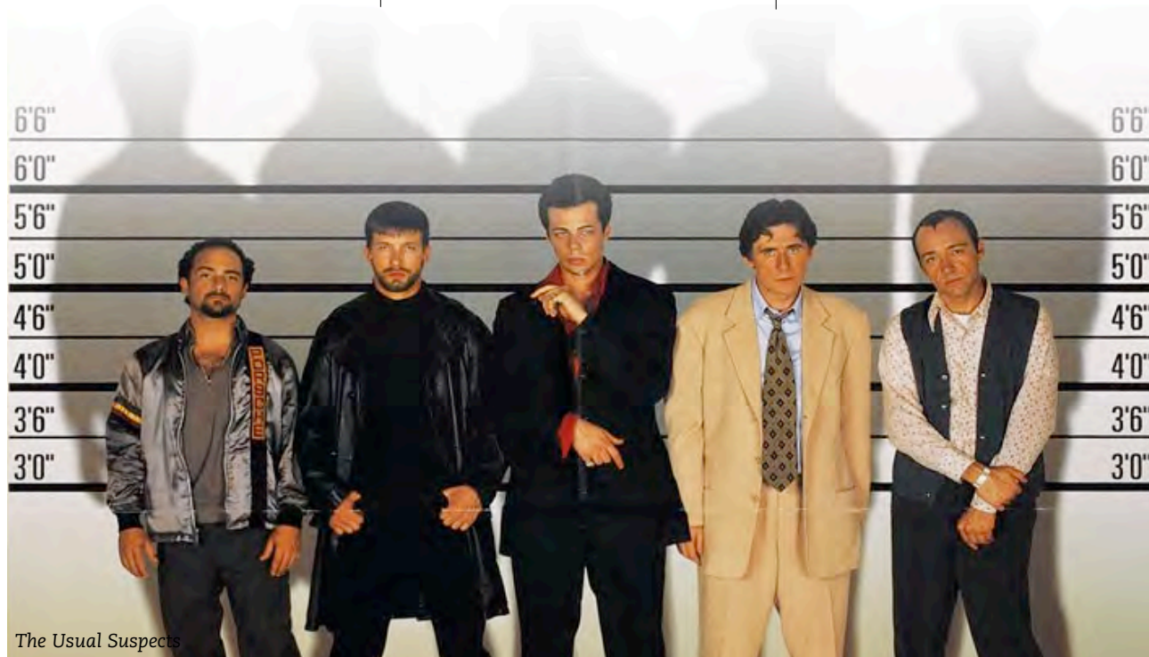
The Usual Suspects

After discussing the differences between novel form and the linear format of film, the interviewers ask what attracts Franklin to the noir genre. Arguing that DEVIL IN A BLUE DRESS fuses noir with social realism, Franklin asserts the film transcends the noir genre through the highlighting of Easy's external demons. The lifestyle of L.A. in 1948 rather than then noir genre of 1948, is reflected in the film and also, unlike classic noir, the film contains a degree of optimism. In regard to the issue of race within the film, the director points out that the film opened the same weekend as the verdict of the O.J. Simpson trial. This may have adversely affected the potential white audience and contributed to its box office failure.