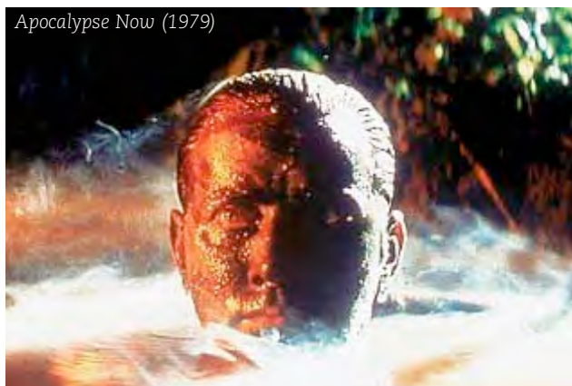
BFI National Library

New York: Charles Scribner's Sons, 1975. 236p. illus. appendices. bibliog.index.