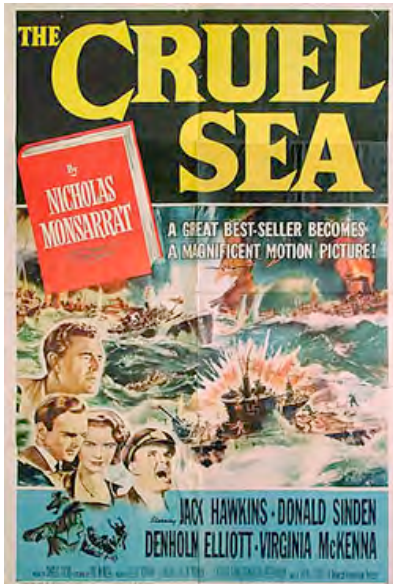
The Cruel Sea (1952)

Chapter one deals with the impact of the Vietnam War upon American cinema and contains a short but dense comparison of PLATOON and FULL METAL JACKET . The author argues that the close-up shots and personal dilemmas of PLATOON ignore the wider historical perspective. He criticizes both films for coupling the terror of real war with the vicarious violence of cinema. He also argues that such films are “consumer packages of history”. It notes the importance of music in these and other Vietnam War films and TV programmes as cultural reference and selling points.