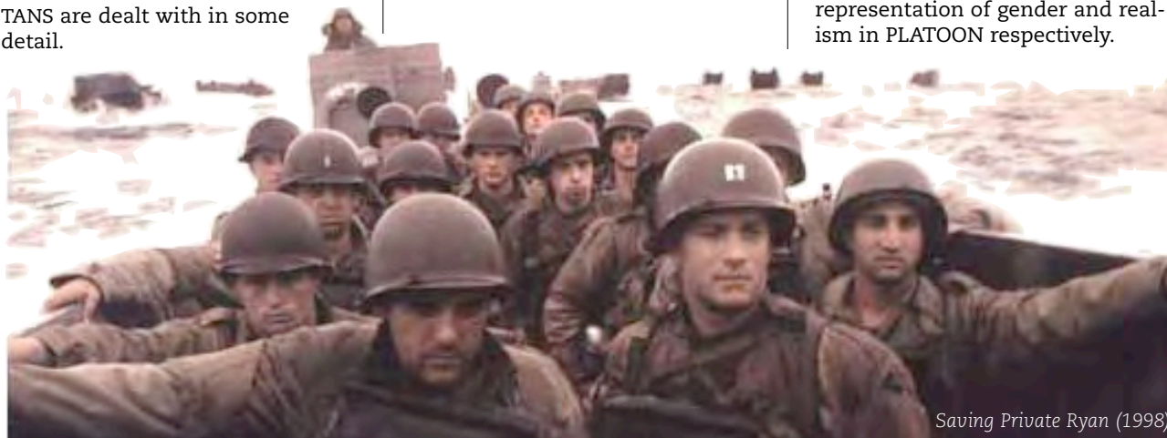
Saving Private Ryan (1998)