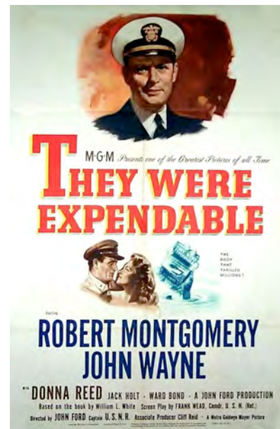
They Were Expendable (1945)