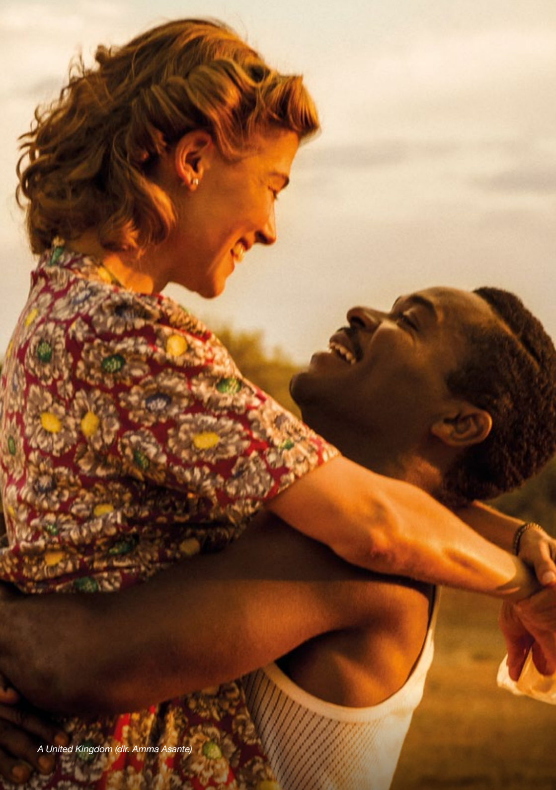
A United Kingdom (dir. Amma Asante)