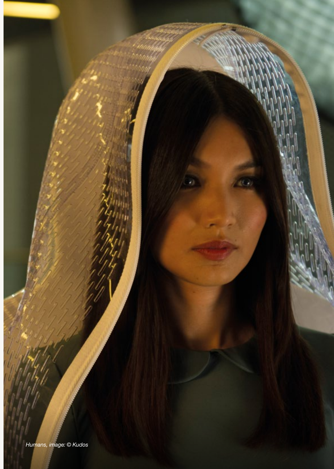
Humans, image: © Kudos

* Separate categories apply for documentaries.