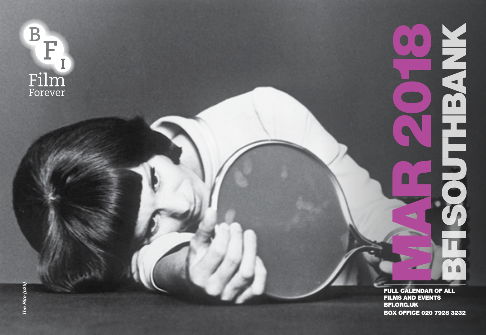
The Rite (p25)

JOIN THE BFI FOR PRIORITY BOOKING AND TICKET DISCOUNTS Join here today or at bfi.org.uk/join