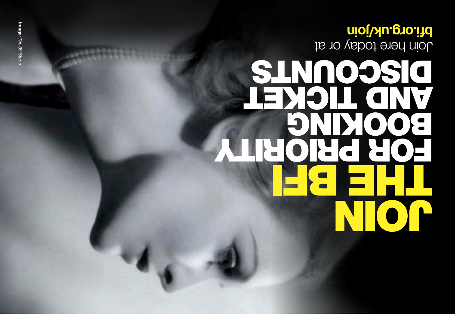
Image: The 39 Steps