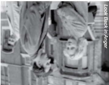
Look Back in Anger