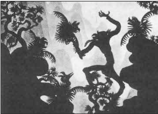
The Adventures of Prince Ahmed - the first full length animated feature