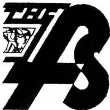
The Film Society Logo

1995 WAS THE 70TH ANNIVERSARY of the founding of the Film Society, making it an appropriate choice as the subject of the first in an occasional series of Guides to the Collections to be published by the Library and Information Service of the British Film Institute; appropriate because so much of the film culture we take for granted today stems from the Society's innovative programming. A national movement was born which formed the basis of local film societies, independent regional cinemas and the National Film Theatre; many of its prints were donated to the National Film Archive in 1942, and the work which it began has been continued by the BFI, the British Federation of Film Societies, and the film festivals which have sprung up since all over the world.