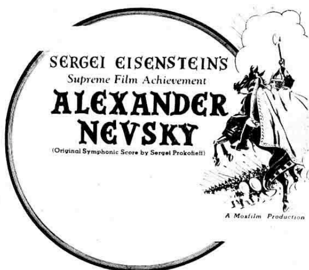
The screening of Alexander Nevsky in April 1939 was to be the Society's last

Soviet films like Potomok Chinglis-Khana and Staroye i Novoe were shown for the first time in Britain by the Society, and Pudovkin and Eisenstein were invited to lecture to members on film technique.