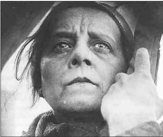
Pudovkin's Mat screened in 1928

IRIS BARRY was 29 and film critic on The Spectator . She subsequently established the first US film archive at the New York Museum of Modern Art, becoming its first curator, and it is easy to forget how innovative it was at that time to treat cinema as another art. One of her first achievements was to gain the trust of DW Griffith, enabling MOMA to save his archive for posterity. Unlike some single-minded film critics, Barry brought to bear on her work not only a love of films but a literary catholicity of taste, and a love and knowledge of music and painting.